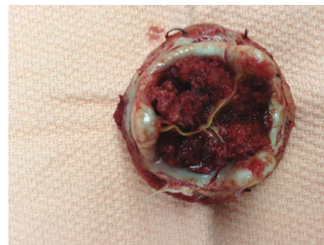
FIGURE 3: Massive thrombus completely obstructing the bioprosthetic valve as seen in the postoperative photo.

Independent predictors of bioprosthetic mitral valve thrombosis include a combination of clinical and echocar-