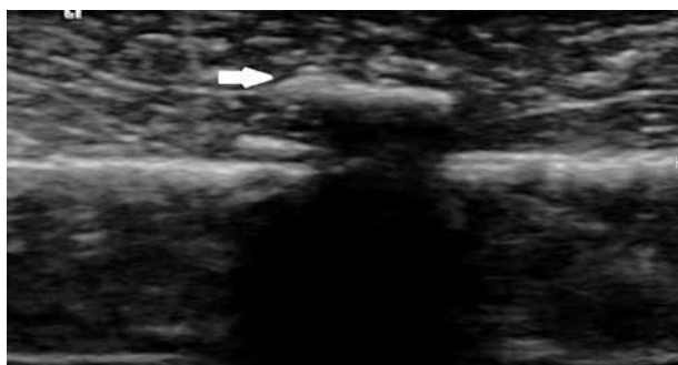
Figure 1. A 1-3 cm glass phantom in pieces of chicken fillet on ultrasonography was hyperechoic (white arrow) with posterior acoustic shadowing

sensitivity for small metals as 79%, 95% for small wood, 93% for small glass, and 100% for large wood and glass FBs implanted in the phalanges. When it comes to the FBs implanted in the palmar surface, the sensitivity was reported as 77% for small glass FBs and 100% for all other FBs [8]. Similarly to our results, US sensitivity increased as the size of the FB increased in this study. Many studies have been conducted with US on non-radiopaque objects, whereas none of these studies have evaluated the size of the FBs. In these studies, sensitivity and specificity values were found to be high for the detection of FBs by US.