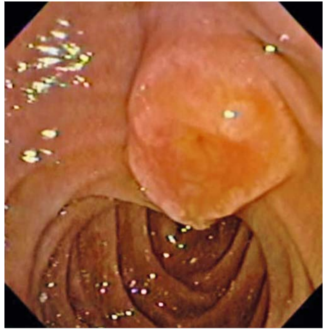
► Fig. 6 Endoscopic image of a major ampullary adenoma with low grade dysplasia in a 19-year-old male patient, Spigelman 0.

Familial distribution of Spigelman score among relatives from each family suggested a familial segregation pattern of duodenal disease. Although the small number of patients with at least one more relative included in the study may limit further statistical analysis of this observation, familial clustering of duodenal/ampullary cancer has previously been reported [14, 15]. A larger study that included 144 patients in 74 families was able to demonstrate that the occurrence and severity of periampullary neoplasia in FAP patients segregates in families [15]. The next step that should be taken in this analysis would be characterization of the molecular background of these patients, in order to determine whether this pattern is the result of a genetic etiology or an environmental effect. Of note, a fa-