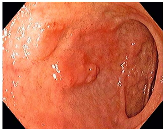
► Fig. 4 Lesion type 2b: Endoscopic image of flat elevated adenoma with central depression of approximately 20 mm size, located in duodenal bulb of a 55-year-old female patient, Spigelman IV.

sion analysis, patients with extraintestinal manifestations have a 7.18 times higher risk of presenting ampullary adenoma (► Table 6 ).