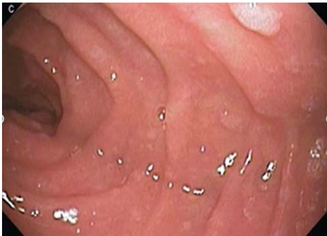
► Fig. 1 Lesion type 1a: Endoscopic image of flat elevated whitish lesions <10 mm, located in second duodenal portion of a 35-year-old male patient, Spigelman II.