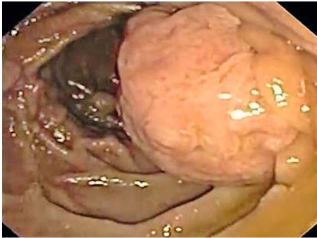
► Fig. 5 Lesion type 3: Endoscopic image of a polypoid lesion, approximately 30 mm size, located in second duodenal portion of a 27-year-old male patient, Spigelman IV.

prognosis. On the other hand, advanced cases of duodenal polyposis showing a negative family history may be the result of a different genetic background. De novo germline mutations are present in 25% of cases of FAP [11, 12]. These mutations have been shown to correlate with a delay in diagnosis and a more severe colorectal phenotype [13]. Perhaps spontaneous mutations could be responsible for a more severe duodenal phenotype as well. Our study is based on phenotype characterization of duodenojejunal disease. This approach may also have its own strengths and pitfalls. Although we can suggest that it is possible that the presence of spontaneous mutations in patients with a negative family history for the disease may have a role for conditioning a more aggressive duodenal phenotype, we can only confirm this with further characterization of the genetic background of this population. These results are not comparable to other studies that intended to identify risk factors for advanced duodenal disease, mainly because a positive family history for the disease was not one of the factors analyzed by those authors [9, 10, 14]. On the other hand, the actual limitation of a wide genetic analysis at the present time encouraged a more profound clinical analysis of the factors that could be implicated in the development of advanced duodenal disease.