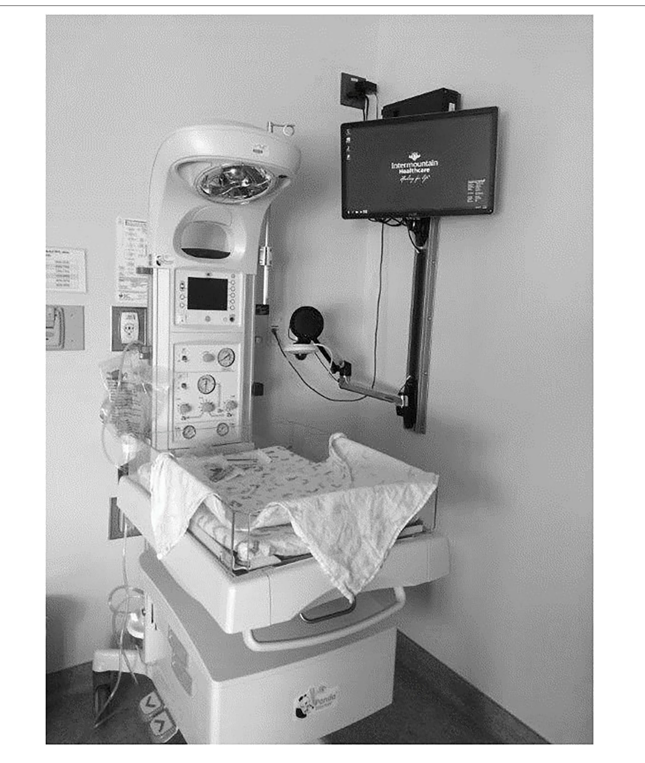
FIGURE 2 | Wall mounted newborn telehealth station at spoke site.