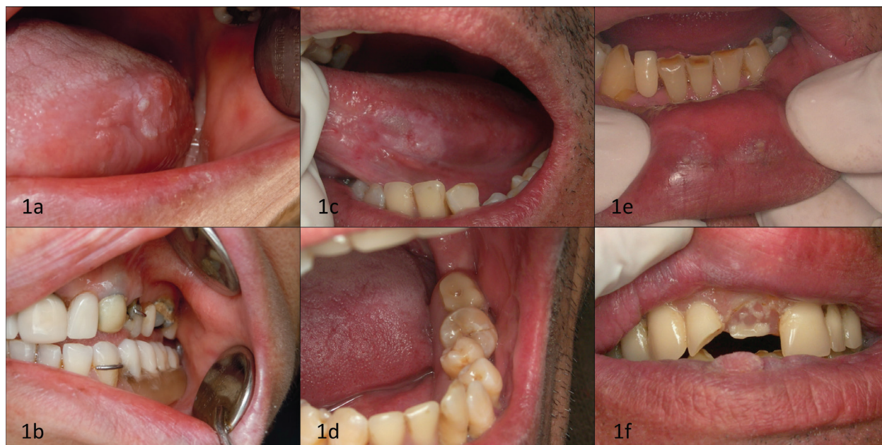
Fig. 1. Clinical cases of oral cancer associated to chronic mechanical irritation. a,b) Female (53 years old), non-drinker and non-smoker, presenting a squamous cell carcinoma on the border of the tongue. Given the inverted overbite, the bicuspid proclination and lack of canine guide, the patient involuntarily bite the area for more than three years. c,d) Male (44 years old), non-smoker, drinker of more than 350,000 gr of alcohol. Lateral tongue border presents a verrucous carcinoma. This area was in relation to CMI originated by the lingual position of lower premolars and molars and a defective partial removable denture, both in contact with the lesion for more than four years. e,f) Male (55 years old), smoker of more than 200,000 cigarettes and drinker of more than 600,000 gr of alcohol. The patient had a leukoplakia without dysplasia. A year later, an upper removable denture was broken, and since then a verrucous carcinoma began its growth in the injured site.

• Oral cancer in relation to the aforementioned traumatic factors that should be present before the patient awareness of the lesion (tumor or ulcer). This data was gathered through oral inspection and anamnesis, taking special caution regarding recall bias. Figure 1 shows clinical examples of CMI's associated carcinomas. Particularly 1c and 1d offers a good illustration of this point, where a verrucous carcinoma of left border and ventral surface of the tongue can be seen in contact with both teeth and removable dentures. Teeth are in a manifest malposition (particularly lower left 2 nd molar and 2 nd bicuspid). Although the patient could not remember with certainty when dental IMC started (originated be-