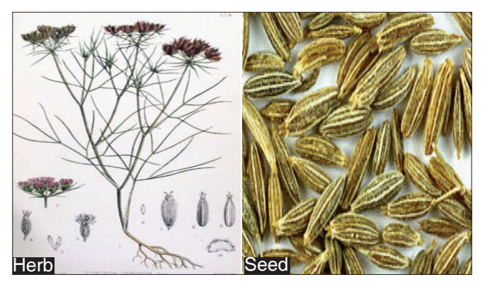
Figure 1a: Cuminum cyminum

In traditional medicine of Tunisia, cumin is considered abortive, galactagogue, antiseptic, antihypertensive herb, while in Italy, it is used as bitter tonic, carminative, and purgative.<sup>[8]</sup> In indigenous Arabic medicines, the seeds are documented as stimulant, carminative, and attributed with cooling affect and therefore form an ingredient of most prescriptions for gonorrhea, chronic diarrhea and dyspepsia; externally, they are applied in the form of poultice to allay pain and irritation of worms in the abdomen. Seeds reduced to powder, mixed with honey, salt and butter are applied to scorpion bites.<sup>[9]</sup> In Poland, caraway is recommended as a remedy to cure indigestion, flatulence, lack of appetite, and as a galactagogue. In Russia, it is also used to treat pneumonia. In Great Britain and USA, it is regarded a stomachic and carminative. In Malay Peninsula, caraway is one important medicinal herb, and in Indonesia, it is used in the treatment of inflamed eczema.[10]