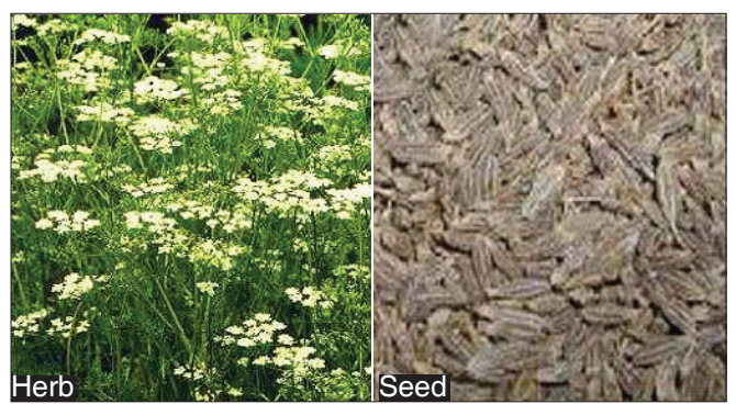
Figure 1b: Carum carvi

In aqueous and solvent derived seed extracts, diverse flavonoids, isoflavonoids, flavonoid glycosides, monoterpenoid glucosides, lignins and alkaloids and other phenolic compounds have been found.<sup>[24,47-52]</sup> Roots of caraway have also been found to contain