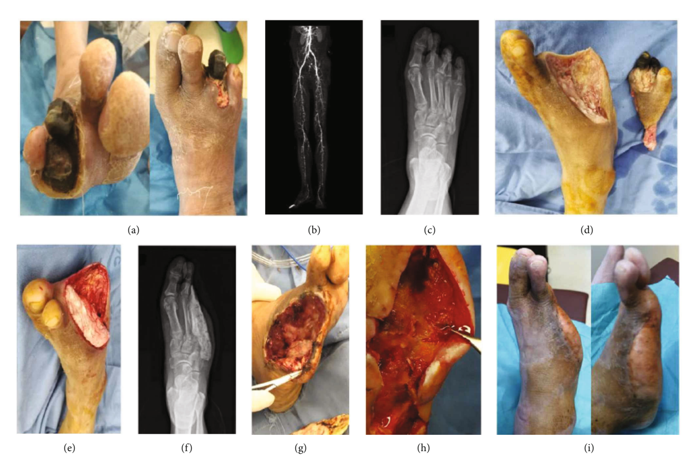
FIGURE 1: The two-staged surgical protocol for the polymethylmethacrylate (PMMA) group: (a) a 74-year-old male patient with diabetic foot ulceration (Wagner grade 4) in the right foot; (b) computed tomography angiography indicated peripheral arterial disease and revascularization surgery failed owing to calcific disease in the distal vasculature; (c) plain radiography showed osteomyelitis on the third, fourth, and fifth toes and corresponding metatarsal bones; (d) the nonviable, infected soft tissues and necrotic toes were debrided during the initial procedure; (e) the defect created by debridement was filled with vancomycin-loaded PMMA; (f) plain radiography showed the PMMA spacer at 3 days; (g) the block of the PMMA spacer was carefully exposed and removed after 3 weeks; (h) the intact induced membrane was a thin, semitransparent pseudosynovial membrane during the second procedure; (i) the ulcer was completely healed without signs and symptoms of osteomyelitis at follow-up.

did not allow for primary closure, the negative pressure wound therapy system (VSD Medical Science and Technology Co. Ltd., Wuhan, China) was applied. With medicalgrade polyurethane foam, this system sealed the wound with adhesive drapes and created a closed microenvironment by the connector tube connected to a wall-mounted suction device.