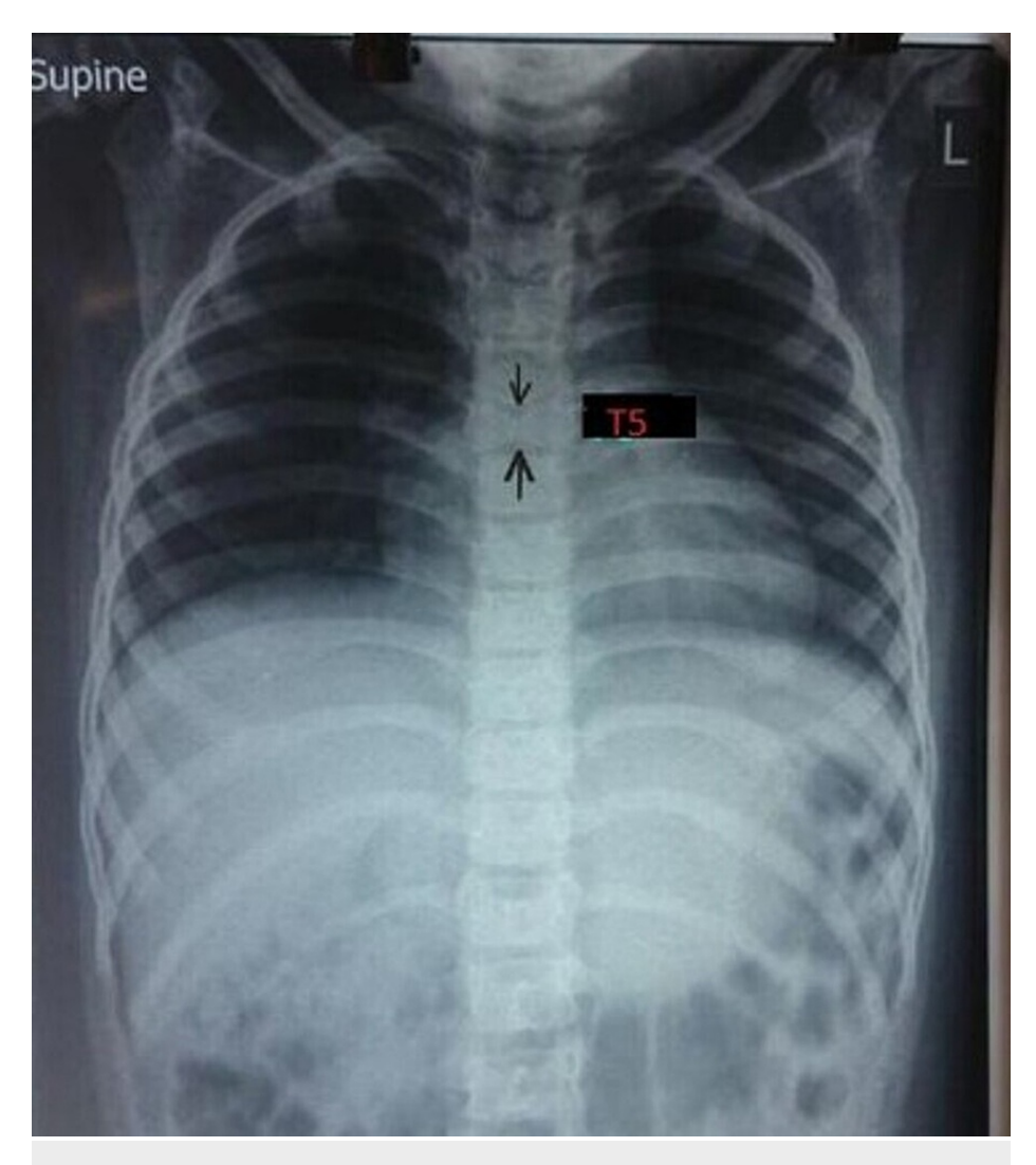
FIGURE 2: Chest X-ray showing butterfly presentation of the T5 vertebra.