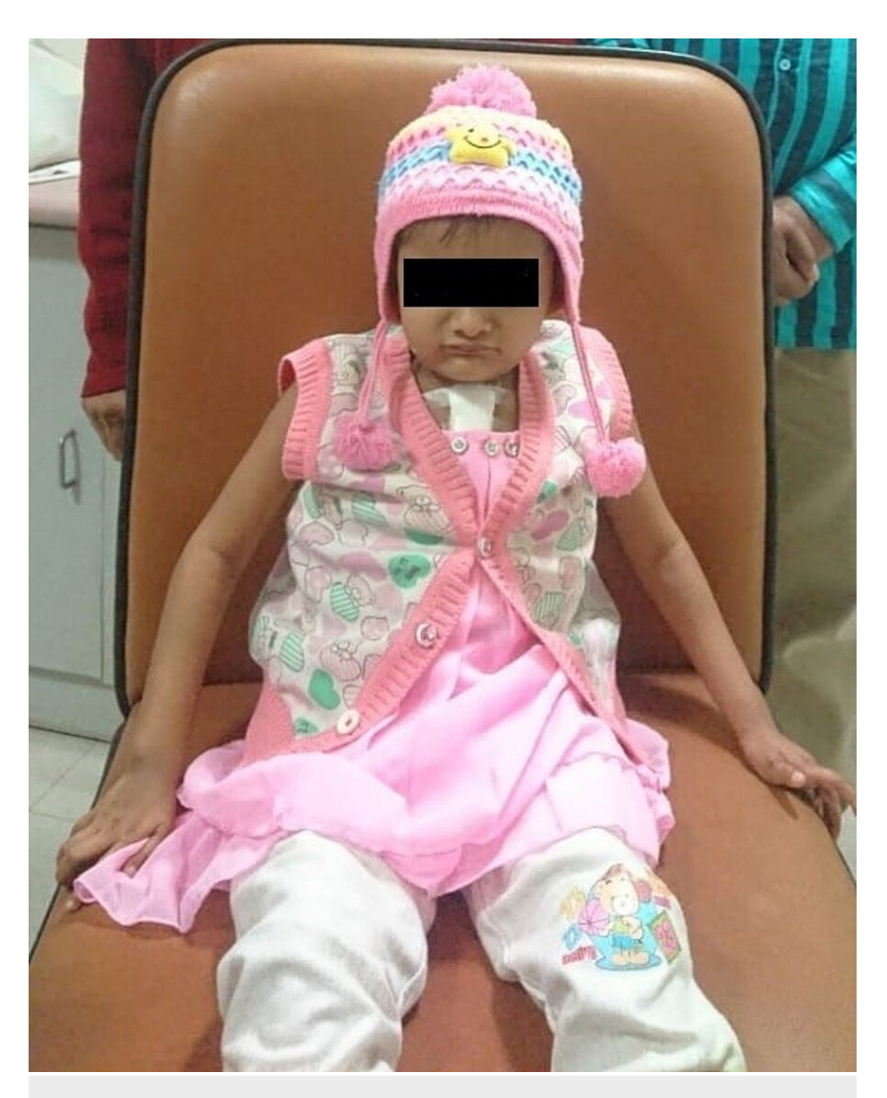
FIGURE 1: Facial dysmorphism features visible on the child.