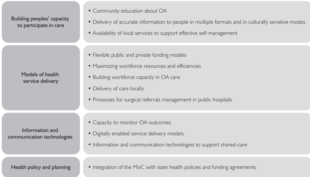
FIGURE 1. Enablers to OA care delivery in Victoria

summarized in Figure 1. Each enabler is supported by suggested implementation strategies within the MoC. The MoC is publicly supported by 20 peak organizations.