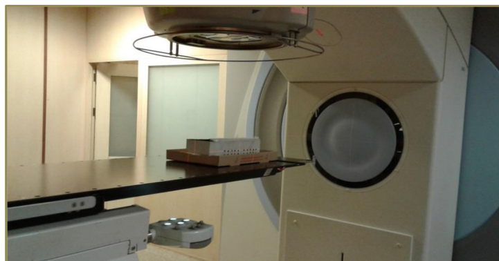
Figure 1: Irradiation setup using Elekta linear accelerator.

After treatment or radiation, the mice were deeply anesthetized intraperitoneally with a combination of ketamine (100 mg/kg) and xylazine (10 mg/kg), respectively, which was in accordance with recent American Veterinary Medical Association (AVMA) guidelines that injection of 100 \mu L of a solution of ketamine: xylazine (10 mg:1 mg) in mice resulted in death within 3 to 5 s after completion of the injection. Therefore, animals had no nervous reflex, and this process eliminated the pain and distress at death [19, 20]. Right femurs were then surgically removed from anesthetized mice at days 3, 9, 15 and 30 after irradiation, fixed in the 10% neutral buffered formalin (NBF, pH= 7.26) for 48 h, processed and embedded in paraffin [21-24]. Then 5 \mu m thick sections were prepared and stained with haematoxylin and eosin (H&E) using standard procedure. The histological slides were evalu-