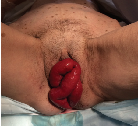
FIGURE 1: Small bowel evisceration through the vagina.