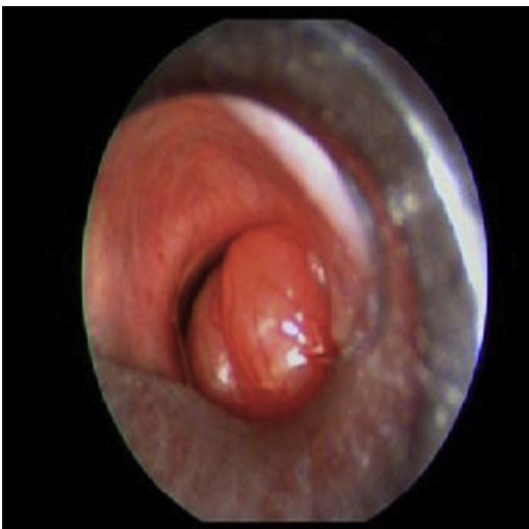
Fig. 2. Bronchoscopic view of vascularized, smooth-surfaced, lobulated mass lesion that was obliterating tracheal lumen after cord vocals.

Because of its histopathological character IMTs have also been named as plasma cell granuloma, fibrous histiocytoma, xanthogranuloma, or inflammatory pseudotumor, but it is popularly known