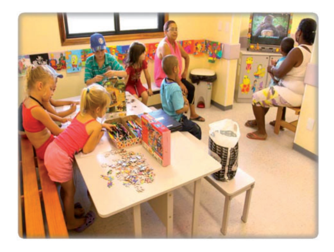
Figure 2. Children of the 2004 Cohort at the recreation room during the fifth follow-up (2010-11).

Joint analyses of the cohort data are welcome and we have collaborated successfully with investigators from the UK (University of Bristol) and with Chile and Mexico through a Latin American cohorts consortium. Exchange of doctoral or postdoctoral fellows between other institutions and Pelotas is very welcome. For young researchers from low- and middle-income countries, there are sponsored postgraduate positions available on a competitive basis. Since 2005, a Wellcome Trust-supported programme has trained 25 MSc and PhD students from Latin America