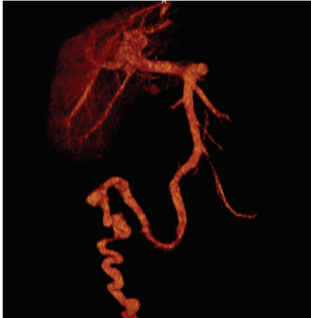
FIGURE 1: Computed tomography 3D reconstruction illustrating the portosystemic shunt.