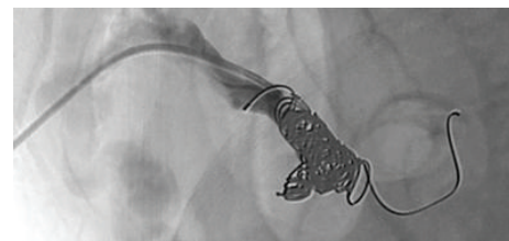
FIGURE 3: Angiography after coiling of the portosystemic shunt.