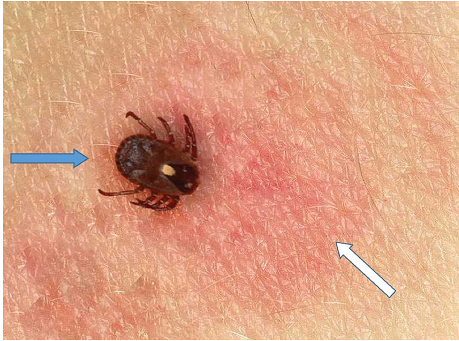
FIGURE 1: The isolated lone star tick (blue arrow) causing Southern tick-associated rash illness, and the target erythematous lesion on the right leg (white arrow) at the time of tick isolation