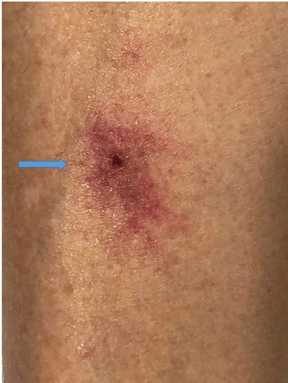
FIGURE 2: Target erythematous lesion on the right leg (blue arrow) at the time of presentation

Her laboratory workup was remarkable for pancytopenia with white blood cells (WBC) 1.1\text{k}/\text{mm}^3 , neutrophils 0.4\text{k}/\text{mL} , red blood cells (RBC) 3.23\text{ million}/\text{mL} , and platelets 27\text{k}/\text{mm}^3 . Aspartate transaminase was 316\text{ units}/\text{L} and alanine transaminase 169\text{ units}/\text{L} . Her chest radiograph and urine analysis were negative. Ehrlichiosis, anaplasmosis, Lyme disease, and hepatitis panels were negative. Peripheral smear showed pancytopenia without inclusion bodies or morula (Figure 3). The patient was started on doxycycline 100\text{ mg} twice a day for 14 days. On day 5, she reported improvement of symptoms. Her pancytopenia resolved with WBC 6.7\text{k}/\text{mm}^3 , neutrophils 2.2\text{k}/\text{mL} , RBC 3.48\text{ million}/\text{mL} , and platelets 151\text{k}/\text{mm}^3 . Her rash resolved after one month.