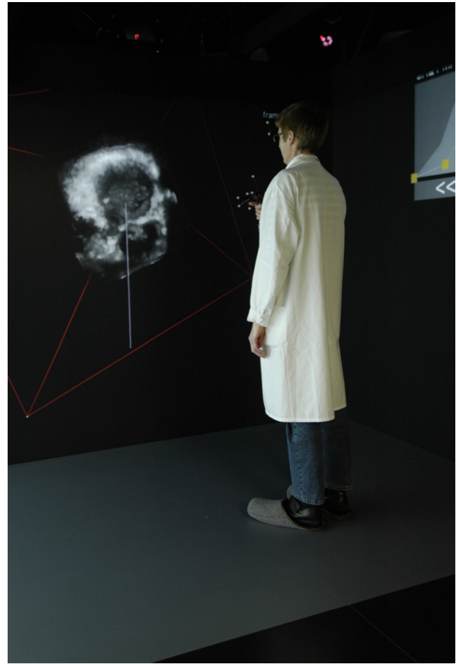
Figure 2 This figure shows a researcher in the I-Space, looking at the 3D hologram wearing a lightweight pair of glasses with polarising lenses. Within the I-space the head and hand movements of the viewer is being tracking by four infrared cameras, allowing a natural interaction with the images that are displayed.

The 3D data sets were acquired with the Philips Sonos 7500 echo system (Philips Medical Systems, Andover, MA, USA) equipped with a 3D data acquisition software