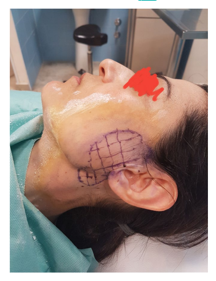
FIGURE 3 The area was subdivided into squares of 1 \text{ cm}^2 for a better distribution of the drug

The botox concentrations were between 16 and 75 U/mL, and the maximal dose used in per participants was 380 U without serious side effects. The distances between the two injection sites were 1, 1.5, or 2 cm. The botox concentration ranged from 2.0 to 5.0 U/cm<sup>2</sup>. Repeated botulinum toxin injections seem to promote a reduction in the severity of the symptoms and the extension of the treated area, as well as space out the period between recurrences, like in our case. One possible explanation would be the atrophy of the eccrine glands, inhibited for long periods.<sup>21</sup> The mean time interval from surgery or trauma to the first injection was 4-5 years. The longest time interval described in the literature is 33.8 years.<sup>9</sup> In our case, the first symptoms of FS appear after 20 years from surgery. There are different causes that can explain the delay request for therapy in FS<sup>22</sup>: