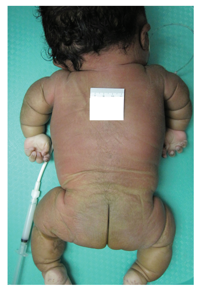
Figure 2. The patient's posterior view at autopsy demonstrating short and bowed upper and lower extremities. Notice redundant skin that seems excessive for the bone length.