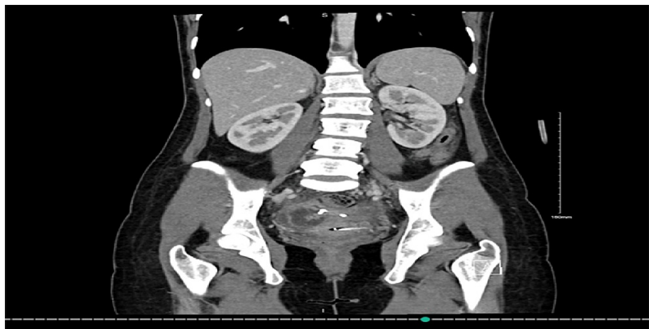
FIGURE 3: CT coronal view illustrating a marked decrease in the size of the previous collection

The patient was shifted to the OR as a level 2 emergency case for laparoscopic evacuation of the hematoma. She was discharged with antibiotics (metronidazole 500 mg and cefuroxime 500 mg) on the fourth day post-evacuation. Six days post-discharge, the patient was readmitted to the ER complaining of fever and RLQ colicky abdominal pain, which was aggravated by movement and not relieved by medication. Another CT scan was conducted that illustrated a slight decrease in the size of the previous fluid collection; it now measured 9.1×5.8×8.8 cm. Furthermore, the left ovary was embedded in the fluid collection. The interventional radiology team planned evacuation of the fluid collection via pigtail catheter insertion. Six days after pigtail catheter insertion, a CT scan demonstrated a marked decrease in the size of the collection (Figure 3).