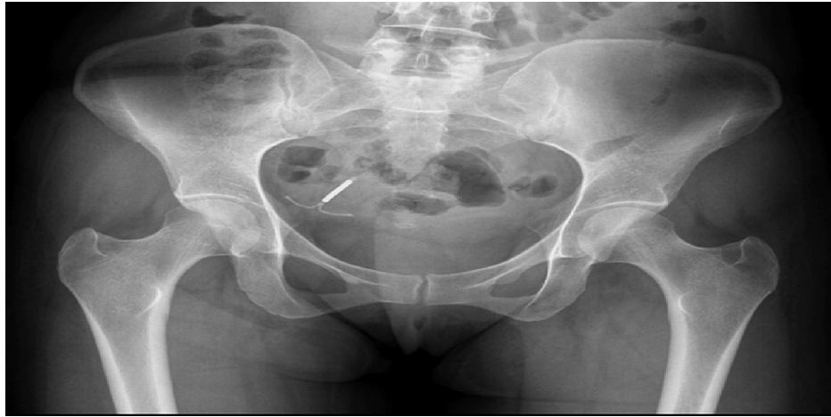
FIGURE 1: Intrauterine device in the right lower pelvic region

Subsequently, the patient was informed of the migrated IUCD and of the risk of a right salpingo-oophorectomy in case of bleeding; she was booked for an explorative laparoscopy and IUCD removal after consent was obtained.