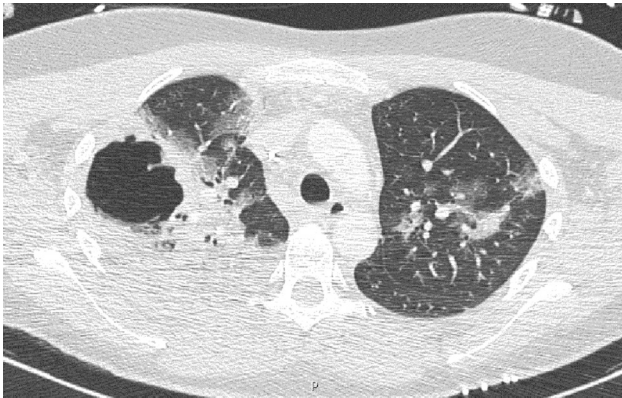
Figure 1. Chest computed tomographic scan shows the presence of bilateral, multiple areas of consolidation with extensive necrosis and abscess formation (5.8 × 5.6 cm) in the right upper lobe.

possible. An extensive decortication and right-sided upper-lobe resection were performed.