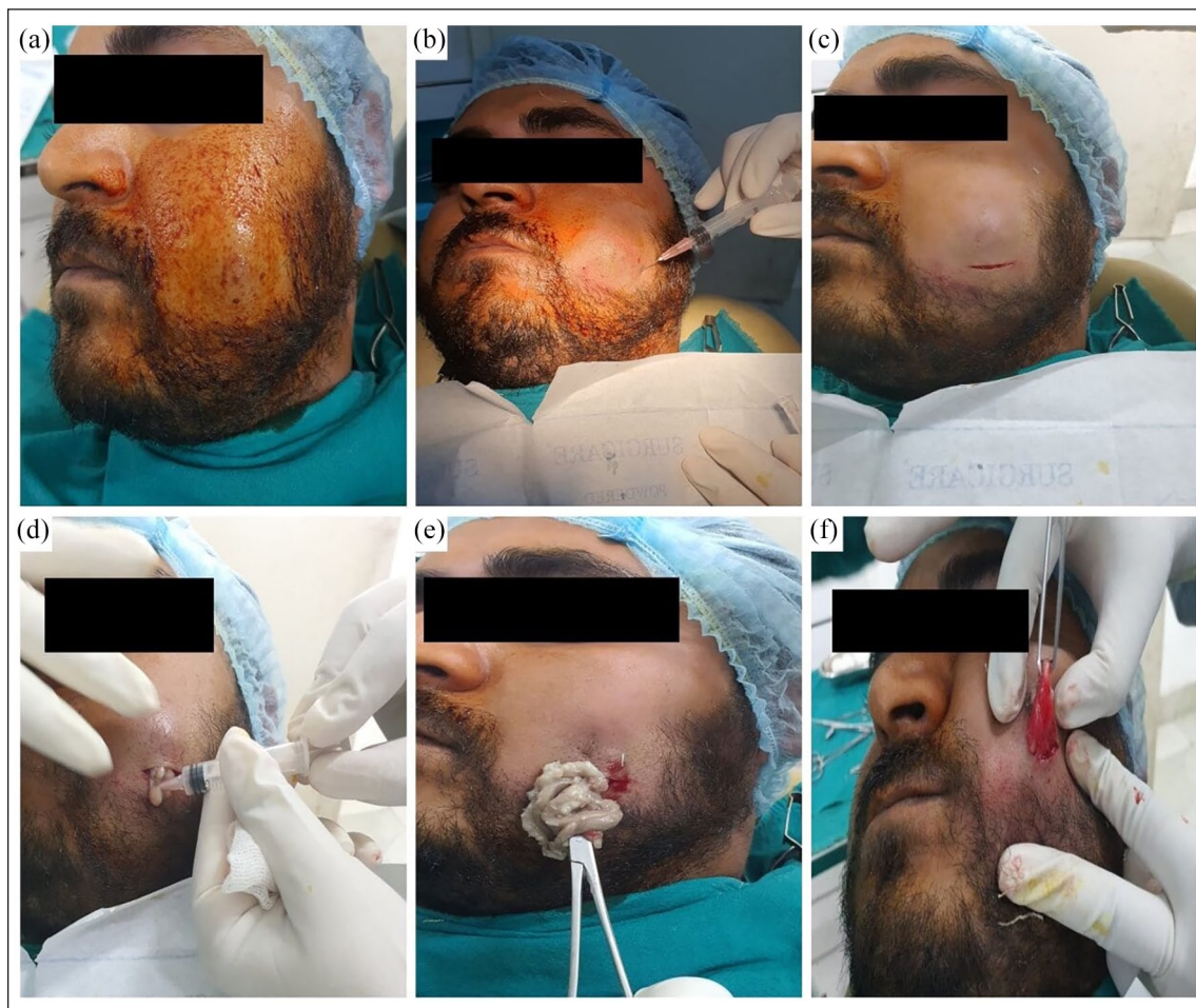
Figure 2. Preparation of incision site, collection of exudate and complete removal of cyst. (a) Under aseptic condition (using betadine solution) the facial hair were trimmed; (b) aspiration did not yield any results due to the cheesy thick swelling contents; (c) horizontal stab incision was given; (d and e) Cheesy, keratinous, granular, paste-like semi-solid discharge from the swelling site and (f) complete removal of cyst wall lining.

wall, thereby confirming the diagnosis of epidermoid cyst. No inflammatory infiltration was noted in the sample.