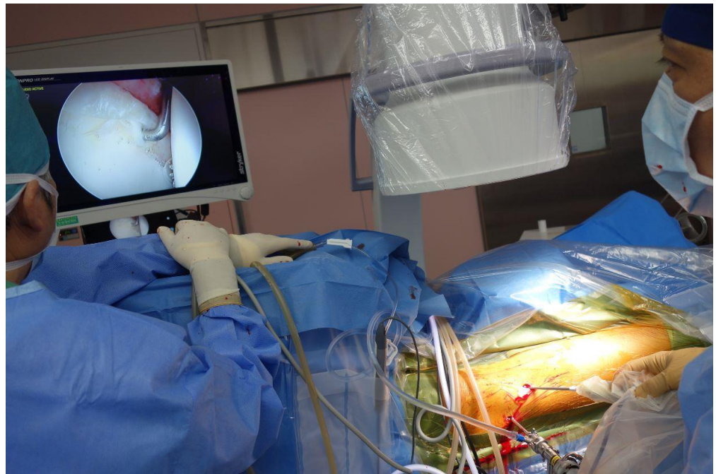
Figure 2. The surgeon (on the right) is measuring the resistance force of the labrum with the probing device. The process is directly observed on the monitor.

Ten fresh-frozen specimens of cadaver pelvis and proximal femur were used to simulate normal hip arthroscopy [5]. The donors included one man and nine women; the mean age \pm SD was 60 \pm 17 years (range: 35–88 years) at the time of death. All of the specimens were radiographically screened to confirm the absence of an osseous abnormality. One author performed all of the measurements. As the probing device used in the cadaver study was a prototype model of the above mentioned device, a pulling distance of the probing device was controlled 2.5 mm manually on the arthroscopy monitor (i.e., using a half distance of the 5-mm probe interval marking on the probe) [5]. The resistance forces of the intact (1) and detached (2) hip labrum of cadavers were recorded and were compared with the aforementioned patients' labrums.