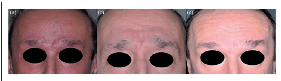
Figure 2. Face of a patient with scleromyxoedema: (a) before treatment, showing severe erythema, papules and plaques, especially on the glabella, thinning of the eyebrows and reduced mobility; (b) after 3 months' high-dose intravenous immunoglobulin therapy, showing improvement in erythema and oedema and improved mobility; (c) after 5 months' high-dose intravenous immunoglobulin therapy, showing further improvements in erythema and mobility, with disappearance of the papules and plaques on the glabella.