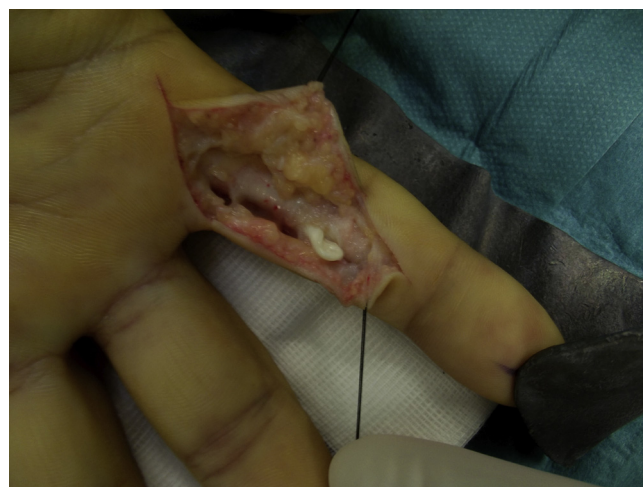
Fig. 3. Intraoperative image of the partially lacerated ulnar FDS slip before debridement.