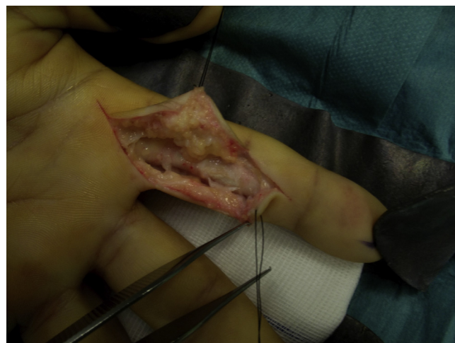
Fig. 4. The pulley system was left open on the ulnar side following the tendon tag excision.

injured digit. Between the ultrasound and the MRI, we opted for the latter one. The ultrasound imaging is operator dependent, and we felt that our radiology department had a much greater experience diagnosing musculoskeletal conditions with the use of MRI. Instead of a variation in the contour as described by Okano et al. [3], we were able to observe the fully lacerated tendon tag.