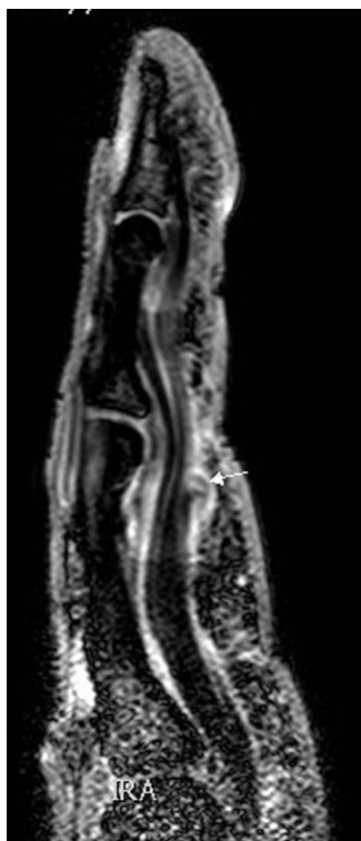
Fig. 1. Magnetic resonance T2 weighed sagittal image showing the impinging flexor tendon tag (arrow).

tendon or pulley was useful in the diagnosis of partial flexor tendon lacerations.