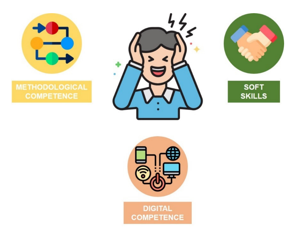
Figure 1. Teacher's skills and competences to cope with COVID-19 pandemic and the virtualization of education.

Therefore, in order to overcome this situation many teachers have transformed their teaching methods, relying on various competencies and skills (Figure 1): (i) methodological competence [19]; (ii) soft skills [22]; and (iii) digital competence [23].