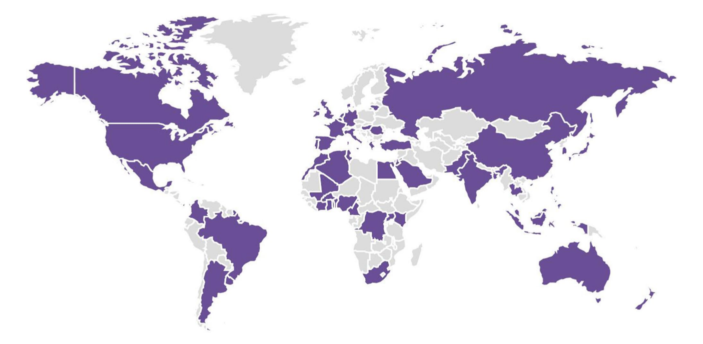
Fig. 2 A map of countries represented by attendees at the 2021 Oncofertility Around the Globe meeting