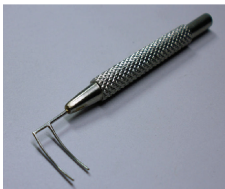
FIGURE 3: Harms trabeculotomy probe with double parallel prong design.

Allen and Burian described an alternative technique of trabeculotomy using specifically designed rigid probes (Figure 2) that achieved sector opening of the trabecular tissue in 1962 [11]. Compared to the flexible nylon filament or the later-adapted polypropylene filament as described by Beck and Lynch [15], the rigid probe offers better directional control once it enters the Schlemm's canal, and the later double parallel-pronged design (as in the Harms trabeculotomy probes, Figure 3) helps the surgeon determine the probe's position in the canal and anterior chamber. A single incision allows opening of approximately 120 degrees of angle. In the case of treatment failure, subsequent angle surgery is usually offered prior to considering glaucoma drainage device implantation.