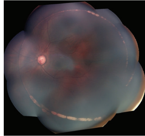
FIGURE 1: Color fundus photography demonstrating circumferential chorioretinal scarring after misdirection of blunted 6-0 polypropylene suture used in filament-assisted circumferential trabeculotomy.

Trabeculotomy involves disrupting the tissue between Schlemm's canal and the anterior chamber using an ab externo approach to create direct communication. Currently, there are at least three different approaches: rigid probe, suture, and illuminated microcatheter. Pilocarpine is used for pupillary constriction and a peritomy is typically performed. A partial-thickness scleral flap is created and Schlemm's canal is identified, incised, and cannulated for 360 degrees. High success rates ranging from 87% to 92% in cases of PCG presenting before one year of age make trabeculotomy an excellent procedure [9]. Other benefits of trabeculotomy are that it can be performed with a cloudy cornea and one incision can be used to treat the entire 360 degrees. Like