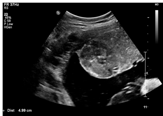
Figure 1 A gray-scale ultrasound image shows a well-defined circumscribed ovoid heteroechoic placental mass with a 4.99 cm diameter.

Note: The mass protrudes from the fetal surface of the placenta and is in contact with the amniotic cavity.