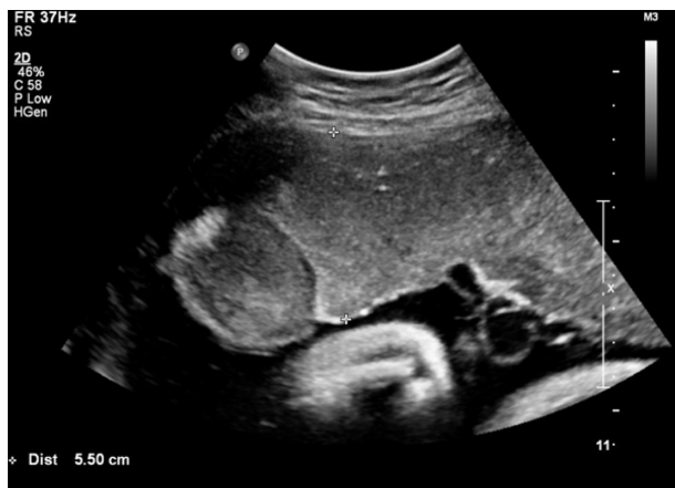
Figure 2 A gray-scale ultrasound image shows the protruding placental mass into the amniotic cavity from a placenta with the thickest anteroposterior diameter of 5.5 cm.

gradual increase of the amniotic fluid volume and the AFI reached 43 cm. The middle cerebral artery peak systolic flow was 49.9 cm/s, which was 1.1 multiple of the median for the gestational age. The cervical length was reduced to 9 mm and the internal cervical os was closed. No change of the size or character of the placental tumor or fetal abnormalities were confirmed. Twelve days after the second amnioreduction, the third one was done, aspirating 1,200 mL of clear amniotic fluid and resulting in clinical improvement. Within 1 month, a spontaneous gradual decrease of the AFI was noticed reaching a normal level for the gestational age at the 36th week of gestation along with gradual cessation of the premature uterine contractions. The size of the placental tumor remained unchanged, with an increasing relative ratio of the placental surface to the placental mass. No fetal abnormalities were confirmed in the ultrasound examinations.