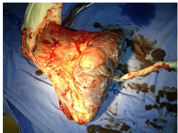
Figure 4 The atypical marginal location of the placental chorioangioma near the placental edge.

signs and symptoms of premature labor. According to the ultrasound documentations, the tumor was not diagnosed earlier. It might not be diagnosed earlier due to its small size or may the tumor was not found at all. No earlier ultrasound photo documentations were available. Management of chorioangioma is usually conservative. No specific treatment is needed in case of asymptomatic cases; however, a careful monitoring with serial ultrasound examinations is needed to predict early complications. In our case, because of the premature uterine contractions along with clinical and ultrasonographical signs of cervical incompetence, a steroid administration was performed to induce fetal lung maturation. In the presented case, the amnioreduction procedures were helpful in reducing the amount of the amniotic fluid, resulting in decreases in intrauterine pressure, risk of the premature uterine contractions, and risk of premature labor. Fetoscopic