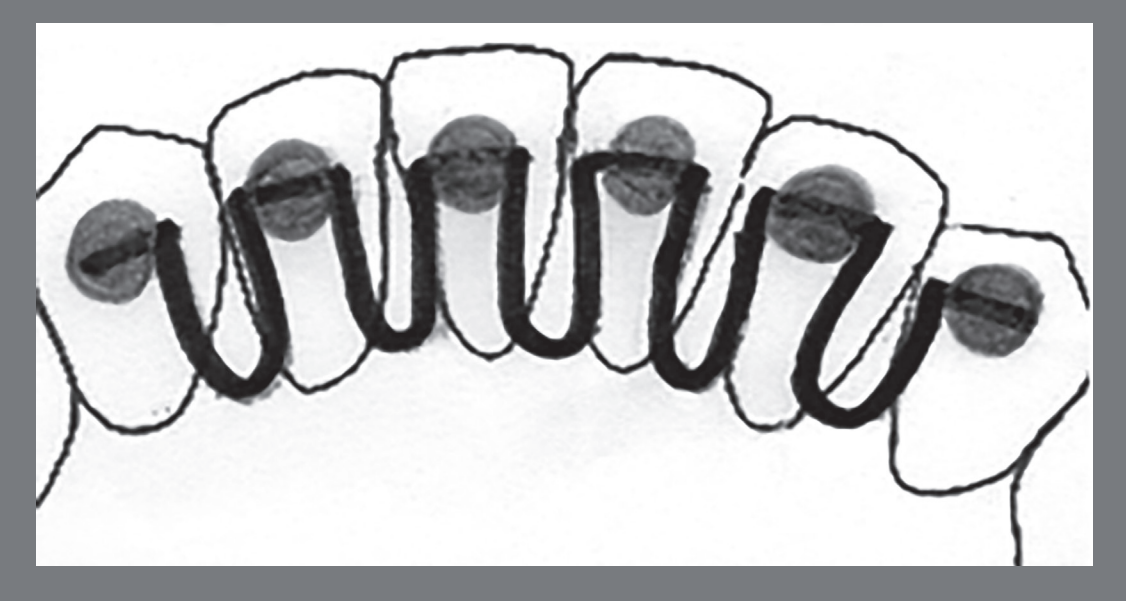
Figure 3: Modified 3x3 bar.