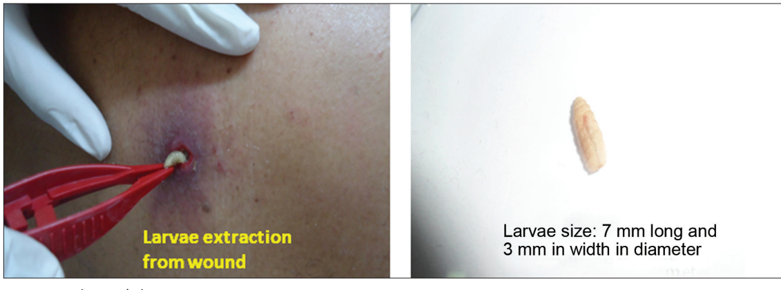
Figure 1: Larva extraction and size

The larva was first washed in distilled water and then cleared in 10% potassium hydroxide (KOH) solution for 26 h. The larva was washed again in distilled water, transferred to 10% acetic acid for 30 min and washed again in distilled water. At this stage, all the internal organs of the maggot were removed and the posterior spiracles were cut transversely. The specimens were then dehydrated in ascending series of ethanol (30%, 50%, 70% and 90%) for 30 min each. The larva was then soaked in absolute alcohol for at least 1 h and then transferred into clove oil. The specimens were mounted onto a glass slide using Canada balsam and left