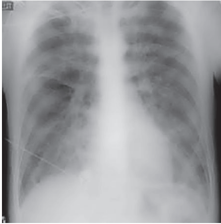
FIGURE 1: Chest radiograph showing pulmonary edema with normal cardiac area.