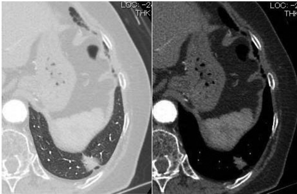
Fig. 1 Chest CT showing a 19-mm nodule in the lower lobe of the right lung. CT: computed tomography