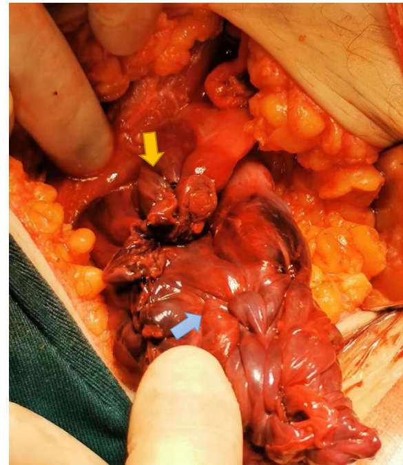
Fig. 2 Postoperative condition. The left ovary was preserved (blue arrow), and the left fallopian tube was removed (yellow arrow), and at the same time, blood clot cleaning of the left ovary was performed

One month after surgery, the results of the endocrine, ultrasound, and tumor marker tests were normal, and menstruation was normal. The results of the endocrine tests were as follows: FSH, 7.35 [1.50–9.10] IU/L; E2, 35.7 [52.80–214.20] pg/mL; P, 0.223 [4.44–28.03] ng/mL; LH, 17.0 [0.50–16.90] IU/L; T, 1.680 [0.31–1.66] nmol/L; and AMH, 4.14 [0.24–11.78] ng/mL. Ultrasound: The left