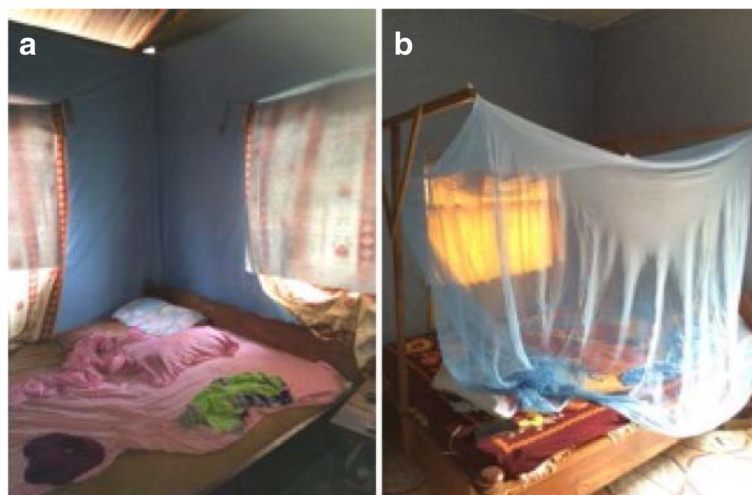
Fig. 3 a PermaNet® Lining. b Interceptor® LLINs

ITWL installation is scheduled to begin in all buffer areas in late August 2015, to allow study teams the opportunity to remedy any unforeseen technical or logistical problems before installation in core households. ITWL installation will be rolled out in tandem with cohort recruitment. The order in which intervention clusters will receive ITWL installations will be randomized; once all eligible cohort members have been recruited in an intervention cluster