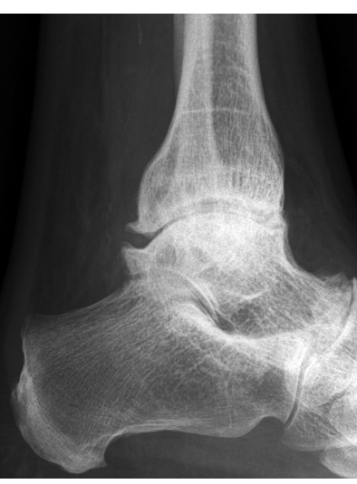
Figure 1. Severe degenerative changes.