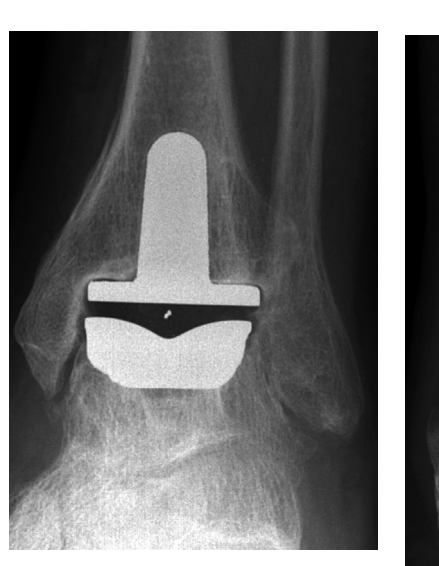
Figure 2. A Buechel-Pappas type ankle prosthesis in situ.

After mobilization of the neurovascular bundle to the lateral side, the joint was opened and the synovium excised. The bony surfaces of the distal tibia and the talus were prepared for placement of the 2 metal components, whereafter the polyethylene bearing was inserted in-between. The wound was closed over a suction drain, which was removed on the second postoperative day. After the postoperative swelling had diminished, a lower leg cast was applied. Antithrombotic prophylaxis was by means of 0.3 mL nadroparin subcutaneously for 6 weeks. Patients started weight bearing after 2 weeks, when a walking cast was applied. After 4 weeks, the cast was removed and patients could start to ambulate as tolerated and to practice movement of the artificial joint. Normally, physiotherapy was not needed.