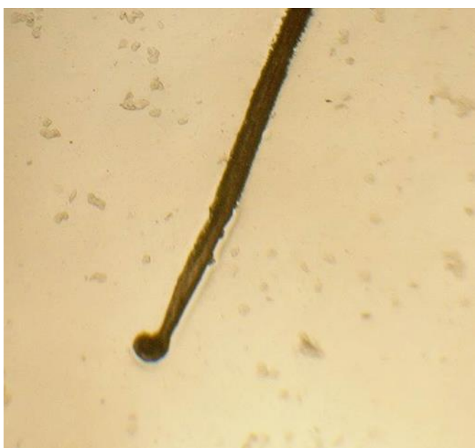
Fig. 2. Microscopic examination shows a naked anagen hair bulb with ruffling of the hair cuticle (original magnification \times 20 ).