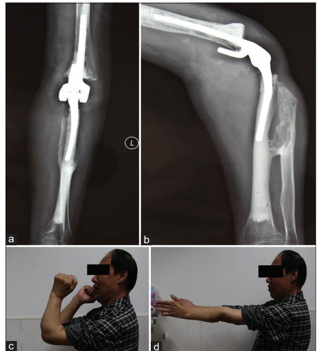
Figure 4: Radiographs and photos taken 3 months after the operation of the revision total elbow arthroplasty and radiographs of the elbow taken 3 months after the surgery. The anterior-posterior view (a) and lateral view (b). The ulnar prosthesis was inserted into the radius. A bone union was found between the proximal ulna and radius. (c and d) Body images taken 3 months after the operation, the patient had a good range of motion compared with the normal side.

the operation. A temporary ulnar neuritis with numbness in the lateral two fingers was experienced; however, symptoms had subsided 1 year after the operation.