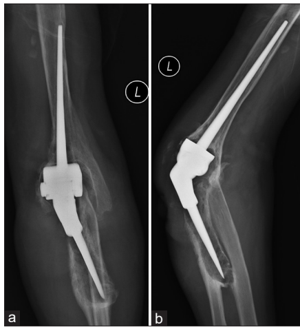
Figure 1: Radiographs of the elbow of patient who underwent the revision total elbow arthroplasty (case 1). The preoperation anterior-posterior view (a) and lateral view (b). The malposition of the ulnar prosthesis is indicated within the lucent line. A massive bone defect in the proximal ulna distal to prosthesis can be seen.