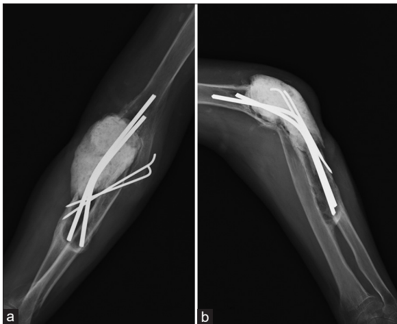
Figure 3: Radiographs of the elbow taken after the first step of revision surgery. Anterior-posterior view (a) and lateral view (b). Antibiotic-containing cement and K-wires were inserted as a temporary spacer.

A 60-year-old female received an open reduction and internal fixation due to an olecranon fracture and a radial head resection due to a radial head fracture 8 years ago (case 3). Because the elbow was still stiff after massive physiotherapy, she received TEA 4 years later. However, after the TEA, stiffness and fever still bothered her, and she underwent debridement three times. During the second debridement, the prosthesis was changed at one stage, but infection recurred. When she came to us in 2013, the flexion-extension ROM was 10–90°, and pronation-supination ROM was –10 to 10°. We initiated a two-stage TEA revision with an ulnar prosthesis in the radius; however, the proximal humeral shaft broke when we tried to remove the humeral prosthesis. Conservative treatment for the fracture was offered, and after 3 months, a plate was placed in the humerus to fix the fracture site at the same time of the TEA revision surgery. The patient reported a painless, functional elbow joint after