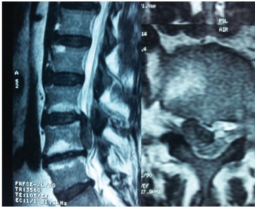
Fig. 1 Lumbar magnetic resonance imaging shows a giant, inferiorly migrated, sequestered disc fragment at the right L3-4 level.