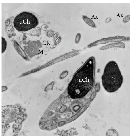
FIGURE 2: TEM micrograph of longitudinal and cross sections of immature sperm characterized by irregular nuclei with uncondensed chromatin (uCh). Cytoplasmic residues (CR) are present embedding swollen mitochondria (M) and coiled disassembled axonemes (Ax). Bar: 1 μm.

from infertile idiopathic patients displayed a weak, dotted staining located in the sperm tail. In infertile patients with varicocele, the label was observed in a high percentage of sperm in cytoplasmic residues, which are abundant around the sperm heads surrounding the coiled tail. Moreover, the signal was clearly detected in the midpiece of the sperm tail. The localization in the sperm tail of 8-iso-PGF 2α in the group of patients with idiopathic infertility and varicocele and the absence in the sperm tail of fertile men seem to suggest the presence of an oxidative damage that could be partially related to the reduced sperm motility. Zerbinati et al. [22] analyzed a group of patients with varicocele showing a reduced number of sperm and motility and observed an altered FA profile compared with the normozoospermic group.