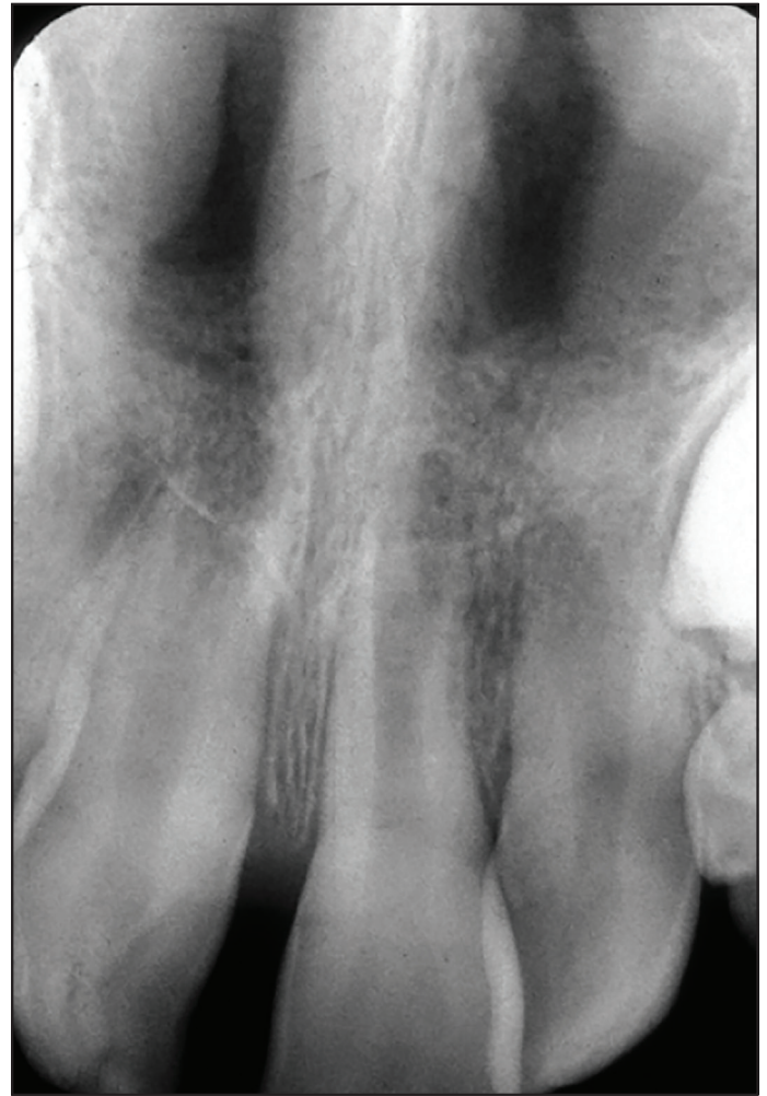
Figure 5. Radiograph of replanted maxillary left central incisor 5 weeks after avulsion