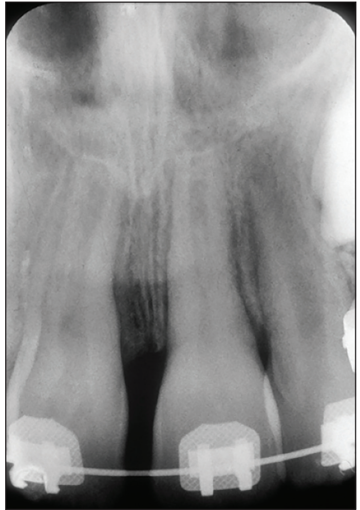
Figure 7. Radiograph of replanted maxillary left central incisor 15 months after avulsion

In a comprehensive four-part clinical study on the prognosis of 400 replanted avulsed incisor teeth in 322 patients, whose ages ranged from 5 to 52 years with a mean age of 14 years and a median age of 11 years, and who were prospectively followed for pulpal and periodontal healing over a 23-year period with a mean observation period of 5 years, it was found that 70% of the teeth were retained (20-23). Pulpal healing among all 400 teeth was 8%, whereas pulpal healing among 94 of 110 immature teeth, in which pulpal revascularization was deemed to be possible, was 34% and increased with decreased root development for teeth in the very early stages of root formation with wide open apices (21). It was determined, according to the root formation stages (1, root length \frac{1}{4} ; 2, root length \frac{1}{2} ; 3, root length \frac{3}{4} ; 4, root length complete; 5, apex \frac{1}{2} closed and 6, apex completely closed) as described by Moorrees (24), that the rate of pulp revascularization was: 16% at stage 5, 35% at stage 4, 40% at stage 3 and 60% at stage 2 (21). It was also found that among 28 avulsed immature teeth replanted at stages of incomplete root development, 25% showed complete root development, 29% showed partial root development and 46% showed arrested root development (22). With respect to periodontal reattachment among all teeth studied, it was found that periodontal healing with no signs of root resorption occurred