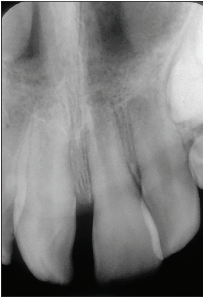
Figure 6. Radiograph of replanted maxillary left central incisor 5 months after avulsion

In a comprehensive four-part clinical study on the prognosis of 400 replanted avulsed incisor teeth in 322 patients, whose ages ranged from 5 to 52 years with a mean age of 14 years and a median age of 11 years, and who were prospectively followed for pulpal and periodontal healing over a 23-year period with a mean observation period of 5 years, it was found that 70% of the teeth were retained (20-23). Pulpal healing among all 400 teeth was 8%, whereas pulpal healing among 94 of 110 immature teeth, in which pulpal revascularization was deemed to be possible, was 34% and increased with decreased root development for teeth in the very early stages of root formation with wide open apices (21). It was determined, according to the root formation stages (1, root length \frac{1}{4} ; 2, root length \frac{1}{2} ; 3, root length \frac{3}{4} ; 4, root length complete; 5, apex \frac{1}{2} closed and 6, apex completely closed) as described by Moorrees (24), that the rate of pulp revascularization was: 16% at stage 5, 35% at stage 4, 40% at stage 3 and 60% at stage 2 (21). It was also found that among 28 avulsed immature teeth replanted at stages of incomplete root development, 25% showed complete root development, 29% showed partial root development and 46% showed arrested root development (22). With respect to periodontal reattachment among all teeth studied, it was found that periodontal healing with no signs of root resorption occurred