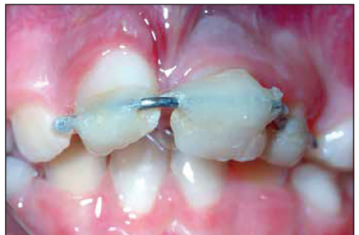
Figure 2. Photograph of replanted and splinted maxillary left central incisor 1 week after avulsion