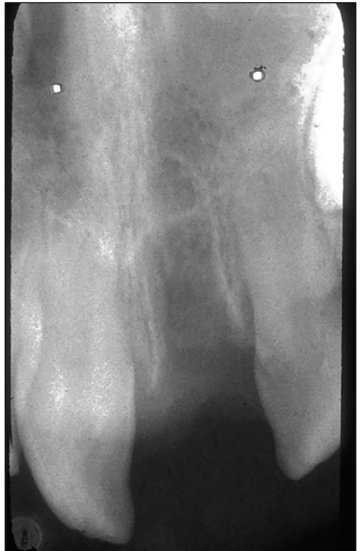
Figure 1. Radiograph of avulsed maxillary left central incisor alveolar socket

sion (Figure 4). Pulp vitality tests were negative for the maxillary incisors, a usual finding for developing immature teeth. Radiograph examination revealed normal alveolar bone with no periapical or periradicular radiolucencies (Figure 5). Five