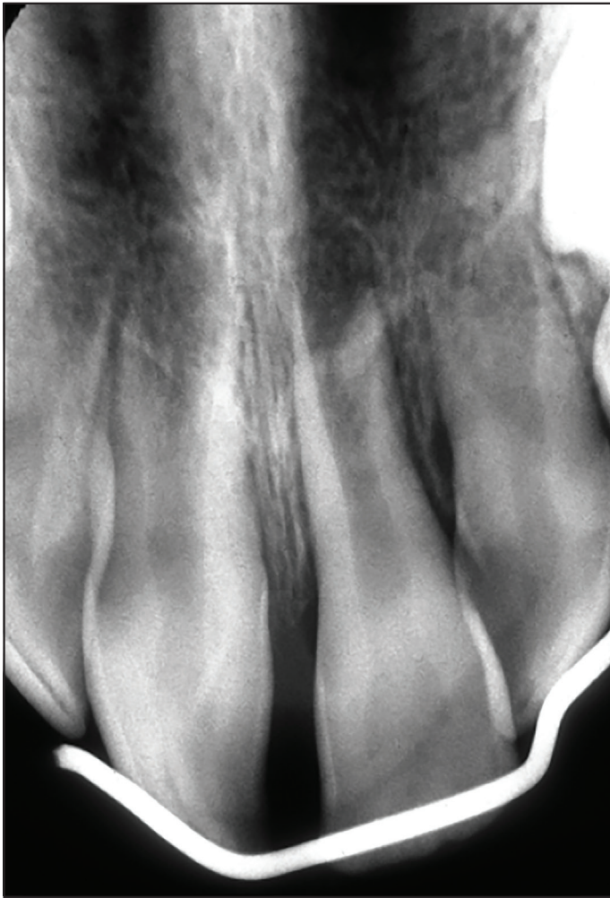
Figure 3. Radiograph of replanted and splinted maxillary left central incisor 1 week after avulsion