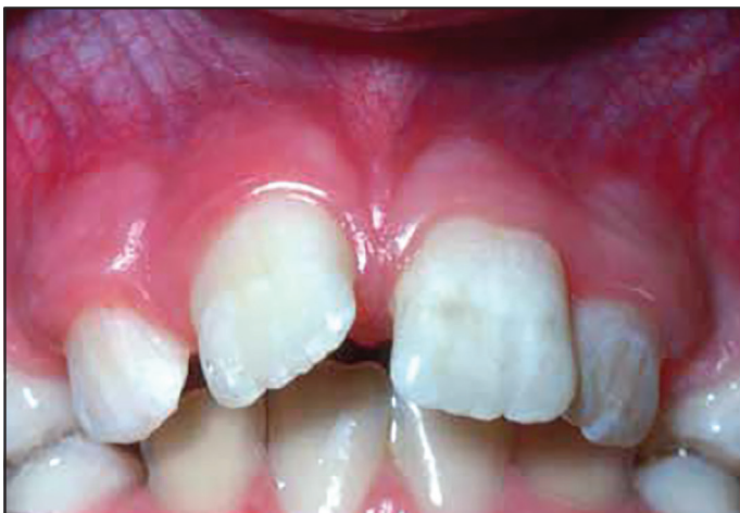
Figure 4. Photograph of replanted maxillary left central incisor 5 weeks after avulsion

months after replantation, all clinical examination parameters for the mucogingival tissues and the maxillary incisors were normal; however, pulp vitality tests continued to be inconclusive. Radiograph examination revealed progressive root growth and apical development of the maxillary incisors with normal-appearing root surfaces and alveolar bone (Figure 6).