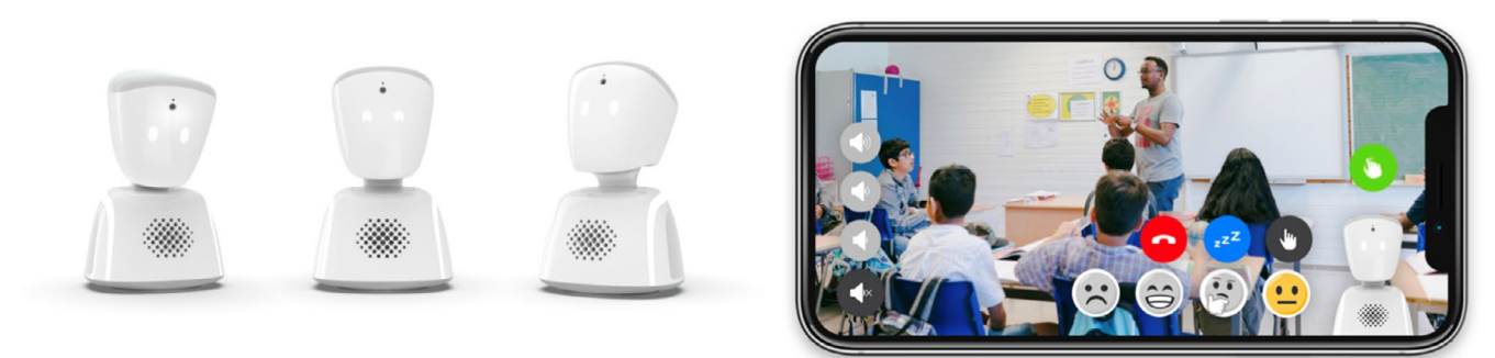
FIGURE 1 AV1 robot. Example of an AV1 telepresence robot. Note: Image is not an actual school class