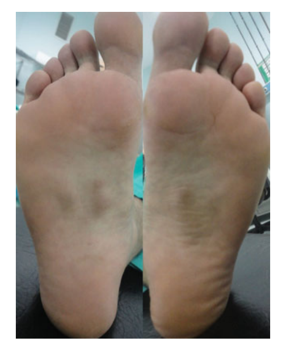
Fig. 1 Preoperative view of nodules of plantar fascia.

frequency of the disease was reported as 1.75/100,000 by Pickren et al and 1/100,000 by de Bree et al.<sup>5,6</sup> The disease is concomitant with Dupuytren disease in 2 to 18% and with Peyronie disease in 4% of patients.<sup>7,8</sup> Our patient had neither Dupuytren nor Peyronie disease. Males are affected more often than females, and symptoms usually start in the third to fourth decades.<sup>1</sup> Our case was a 30-year-old man. Ledderhose