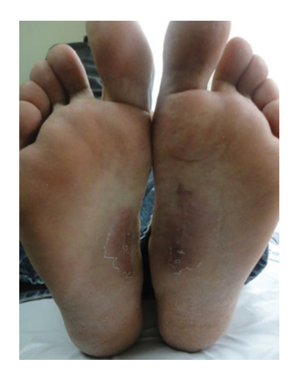
Fig. 3 View at postoperative 8 weeks.

disease exhibits bilateral affection in 25% of cases, as in our patient. ^9