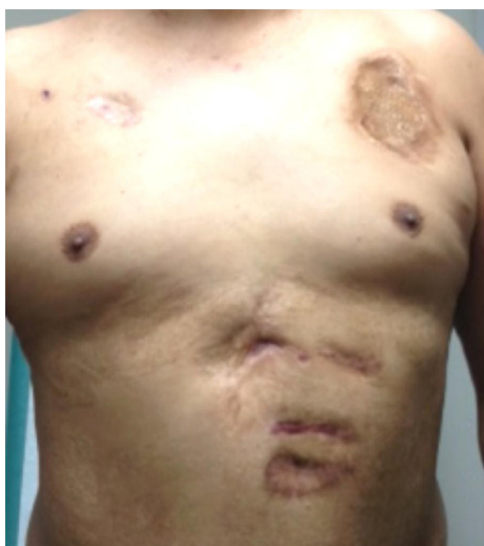
Figure 1 Photograph of patient's chest and abdomen demonstrating significant scarring in both the left and right chest walls and abdomen from prior pacemaker implantation and removal secondary to recurrent device erosions and infections.

The presented case represents a highly unusual and rare set of circumstances in a patient requiring permanent pacemaker support. Conventional approaches to addressing and circumventing recurrent CIED infections, specifically involving the device pocket, were not effective in preventing repeated occurrences, given a primary infectious and dermatologic condition that predisposed to secondary bacterial infections. Repeated infections were not due to poor implantation