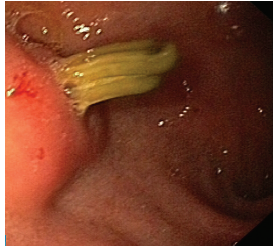
FIGURE 2: The Hem-o-Lok clips at anterior wall of the first part of duodenum.

A very rare complication of laparoscopic cholecystectomy is clip migration with the formation of biliary stones around the clip. In a review of the published world literature within 1979–2008, sixty-nine well-documented cases of such complication were reported [1].