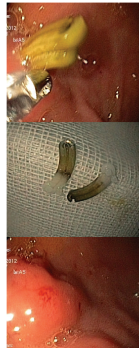
FIGURE 3: The Hem-o-Lok clips were removed using an Olympus grasping forceps.

The MAUDE database is a reporting system mandated by the FDA for the surveillance of medical devices. It includes reports of adverse events involving medical devices that occur