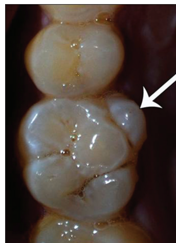
Figure 1: Cusp of Carabelli with respect to 16

A cross-sectional study was conducted in a city named Davangere in Karnataka state, India, where 1600 school children (730 boys and 870 girls) aged 11–16 years were screened for normal variations in the shape of teeth. The investigator was trained to diagnose morphological variations of permanent teeth (deciduous teeth were excluded) among the children by a gold standard examiner who visited the Out-patient Department of College of Dental Sciences for duration of 3 months. The intra-examiner reliability was calculated by randomly selecting 100 children and examining them at two different occasions. The kappa statistics was found to be 0.95 which reflected a high degree of conformity in the examination. Two-stage sampling procedure was adopted for selection of the sample. In the first stage, six government schools and six private schools were selected from the total number of schools (190) with the help of simple random sampling. In the second stage, children were selected from the already selected schools with the help of proportionate stratified