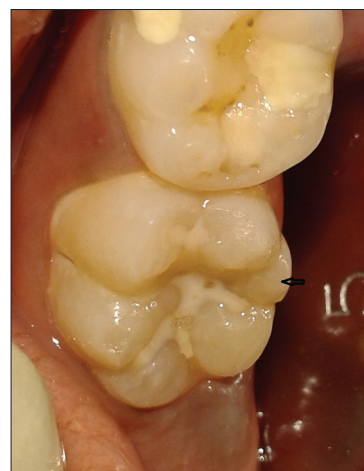
Figure 3: Cusp 7 in mandibular 1 st molar with respect to 36

random sampling. The examinations took place in a suitable room at the individual schools with the help of natural light using mouth mirrors, probes, tweezers, and cotton for removing the plaque whenever necessary.