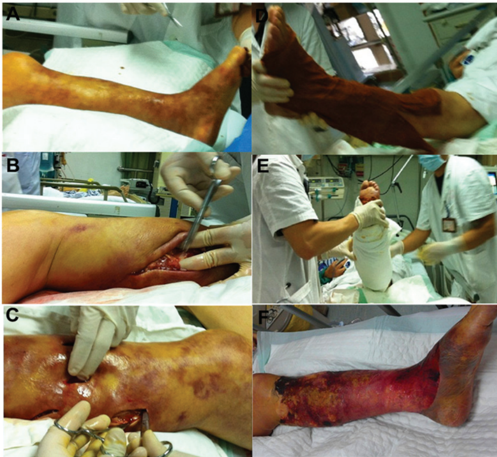
Figure 2. Emergency incision and drainage of the lower left limb of a patient with necrotizing fasciitis. (A) Left lower limb infection with Pseudomonas aeruginosa ; (B) single large incision; (C) multiple small incisions; (D) wet compress with 2.5% iodophor, during the emergency incision and drainage; (E) simple bandaging post emergency incision and drainage; (F) additional debridement once the hemodynamics returned to normal.

that blood purification therapies are effective in restoring immune function by clearing inflammatory mediators from the plasma, as well as improving physiological parameters, including hemodynamics and oxygenation (7). CRRT is the preferred mode of renal replacement in sepsis-induced acute kidney injury (AKI). The data from the acute tubular necrosis and renal studies indicated that vasopressor-dependent ICU patients on CRRT evolve to chronic dialysis less frequently compared with patients who receive intermittent therapies (8). Furthermore, CRRT is recommended during the acute phase of AKI, particularly in patients with severe hemodynamic instability or when extensive fluid removal may allow more effective drug therapy (8). However, it must be taken into account that numerous antibiotics are largely removed by continuous renal replacement therapies (9). In the present case study, the pharmacokinetic characteristics of piperacillin/tazobactam were not measured. However, the adequacy of piperacillin/tazobactam 4.0/0.5 every 8 h was reported in a study of nine patients on CRRT who maintained concentrations >125 \mu\text{g/ml} for the whole time interval (10).