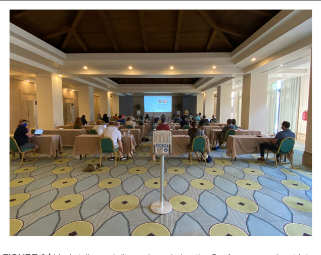
FIGURE 2 | Lively talks and discussions during the Conference, under strict hygiene regulations due to the COVID-19 pandemic.

neutrophils and natural Th17 cells, which protects against oral fungal infection.