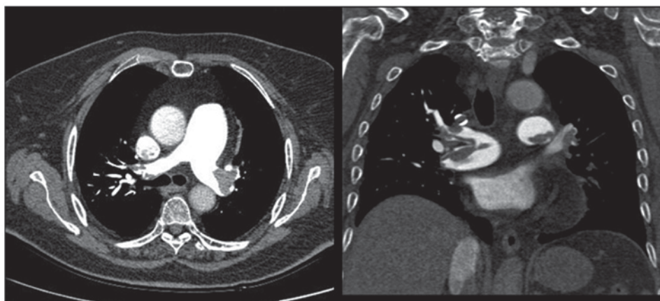
Figure 1. Axial and coronal views of thoracic contrast-enhanced CT. Left and right PTE is displayed in males, aged 45 years, with no clinical symptoms. CT, computed tomography; PTE, pulmonary thromboembolism.

120 KV; tube current, automatic trigger tube current; scanning layer thickness, 0.9 mm; layer spacing, 0.4 mm; and collimation, 128 \pm 0.625 mm; Philips Medical Systems B.V., Holland, The Netherlands). One dual-tube high-pressure syringe (Medrad, Inc.; Bayer HealthCare, Indianola, PA, USA) was used to inject the non-ionic contrast agent (Iopromide, 300 mg/ml; 1.5 ml/kg; Yangtze River Pharmaceutical Group, Ltd., Jiangsu, China) and 20 ml of physiological saline via the ulnar vein. Each patient was inspected in the supine position with a venous injection speed of 4 ml/sec. The scanning range was from the thoracic entrance to the diaphragm level.