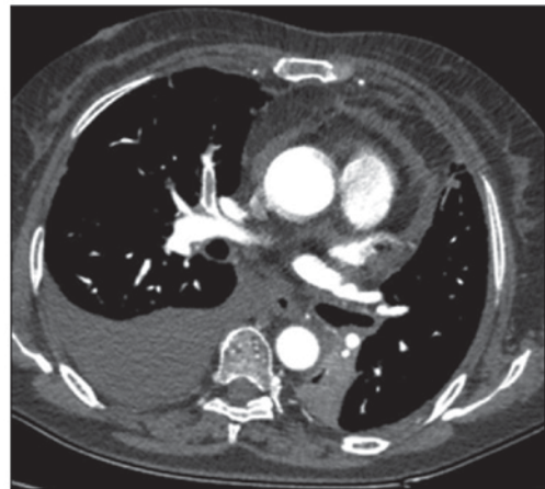
Figure 3. Lung cancer accompanied by right middle lobe thromboembolism, right pleural effusion, and pericardial effusion in female, aged 57 years.

With the development of new multi-slice spiral CT technologies, the detection rate of thoracic contrast-enhanced CT in detecting PTE has been gradually increased. Advantages of these method include non-invasiveness, speed, and the capability to obtain images as far as sub-pulmonary arterial