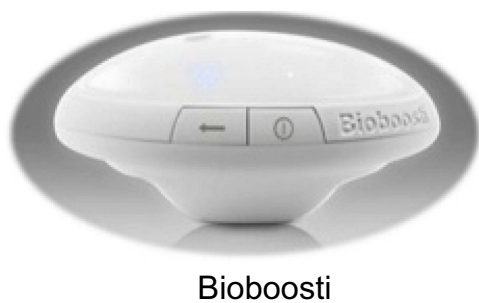
Figure 1 Bioboosti device.