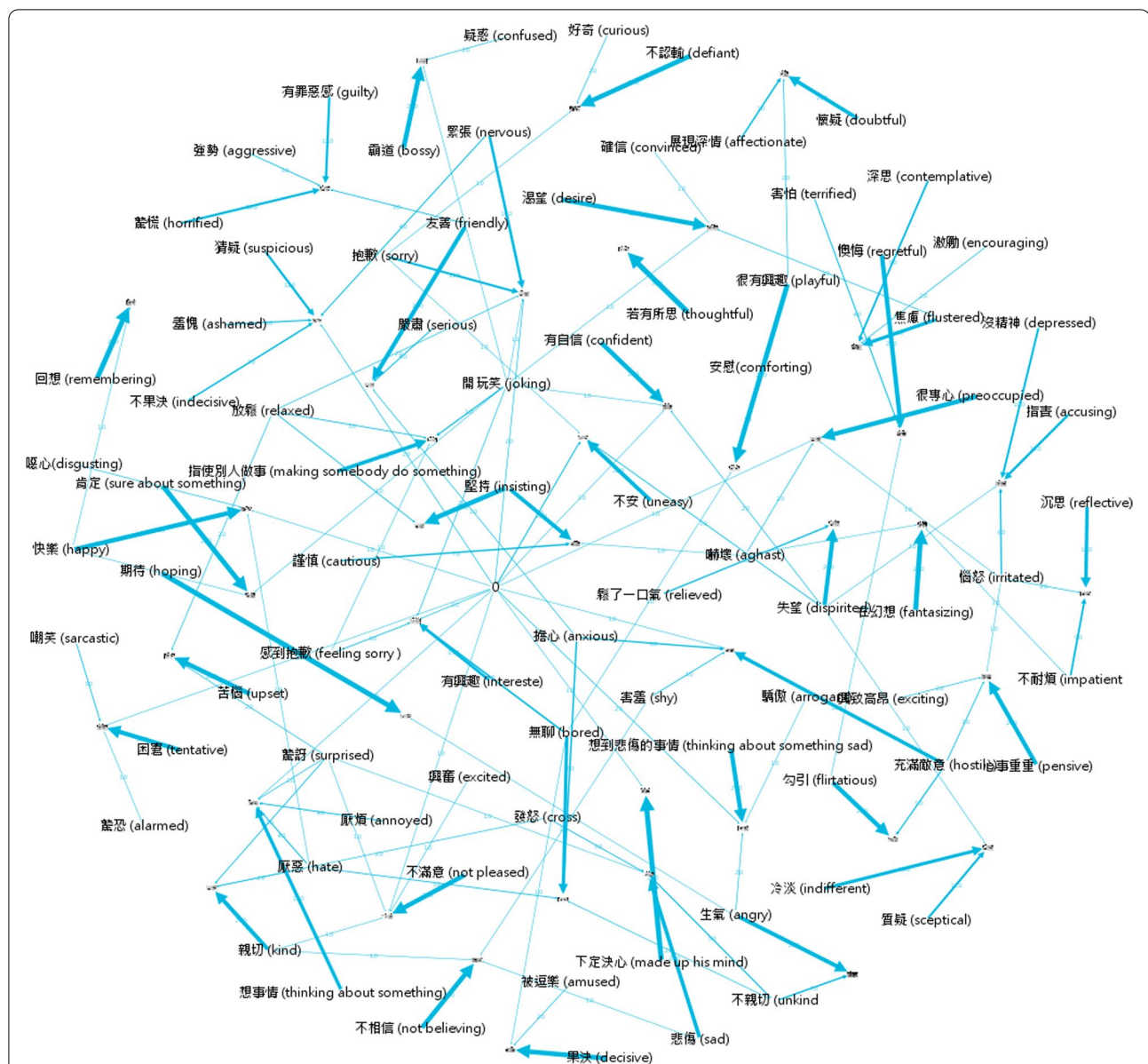
Fig. 3 Response distribution network of the control group. The photographic nodes in the network represent the 43 target words; word-form nodes in the network represent the source words; edges between these nodes represent the relationship of participants' choices between target words and source words. The more times that a word is chosen by participants, the thicker the edge. Density is the actual connections divided by all possible connections in the network. In the present study, there were 5 possible answers (i.e., 5 nodes) and 10 potential connections for a given item. If no actual connection exists, density is be zero; In-degree is an item-based measure that counts connections from all nodes (all possible answers) to a particular node (the correct answer)

classified the 43 target words into positive, neutral, and negative valences to further explore these associations between answering patterns and different types of emotion. Our results showed that in-degree scores were significantly different between the two groups in negative emotion target words rather than neutral and positive ones. Our findings generally support the emotion-specific deficits observed in the previous studies. Male